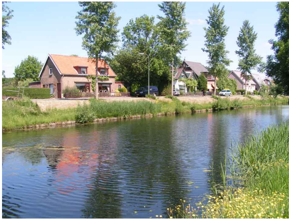
Figure 2. The Dutch locality in the southeastern part of Dordrecht (prov. of Zuid-Holland) inhabited by a population of V. acerosus .

Accidental escape or deliberate release from a garden pond or aquarium seems the most likely explanation for the occurrence of V. acerosus in Dordrecht. The fact that it readily reproduces in garden ponds suggests that this species, once escaped, can easily spread. The site at Dordrecht is connected to other water systems and the finding of a specimen in a nearby river suggests that spreading may already have taken place. It is likely to go unnoticed due to its strong resemblance to the native species.